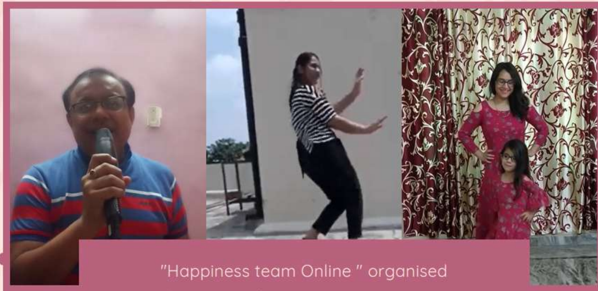
"Happiness team Online " organised Singing and Dancing" competition.

We also organized some online competition like Ludo Game , Lock-down Dairies , Singing and dancing contest.